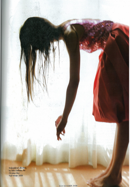
Embroidered silk dress, by John Galiano, for Christian Dior Fall/Winter 2008